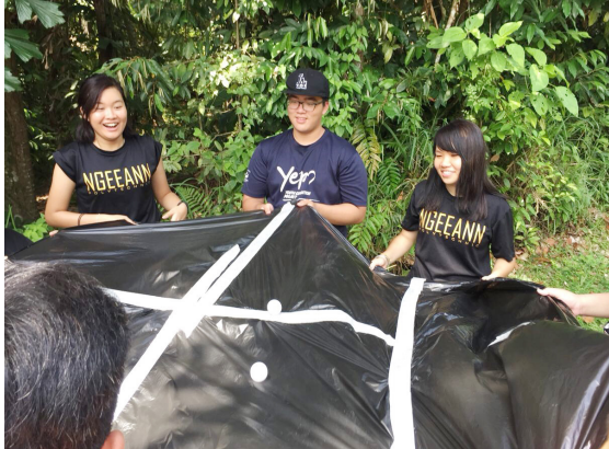
At the end of the camp, the Primers penned down their thoughts and memories on a card which they brought home as keepsakes. We hope that we have enriched the lives of these youths beyond what they already know and enable them to develop skills that will shape them to be better people in society.

I've forged friendships and acquired new knowledge in this camp. I thoroughly enjoyed the adventurous activities that were organized. Venturing alone in the dark was thrilling. Yet it allowed time for me to do self-reflection. From the experience, we gained the confidence to overcome difficulties that we might face. I thank my fellow Primers who had made my experience exceptionally wonderful.