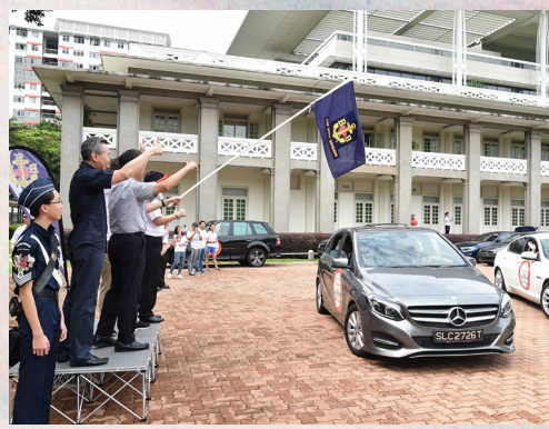
to deliver food hampers to beneficiaries!