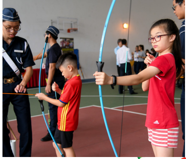
Guests from sponsoring Bethesda (Serangoon) Church playing tag archery.