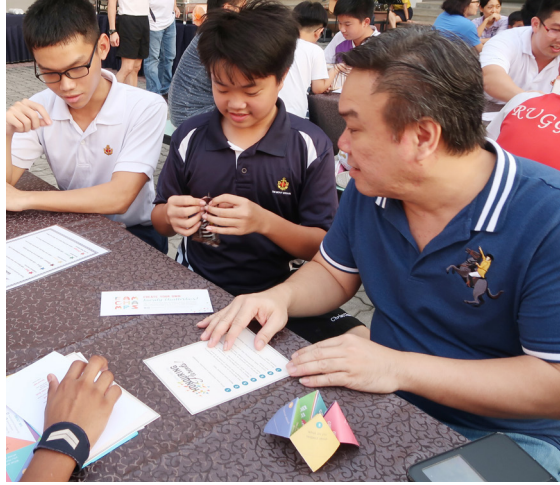
Parents, Boys and Officers playing an M&M Game, which involved simple questions to answer depending on the colour of M&M sweets chosen.

The Boys and Girls also played a Values Game with their parents while enjoying the buffet dinner. The objective of the game was to highlight the uniqueness of each individual and to showcase platforms which the Brigades provide for them to develop skills and gifts.